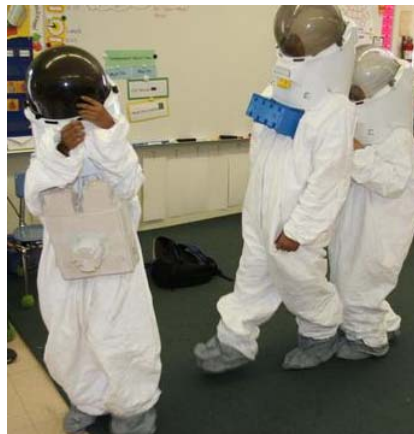
Moon-walking Winnetka students